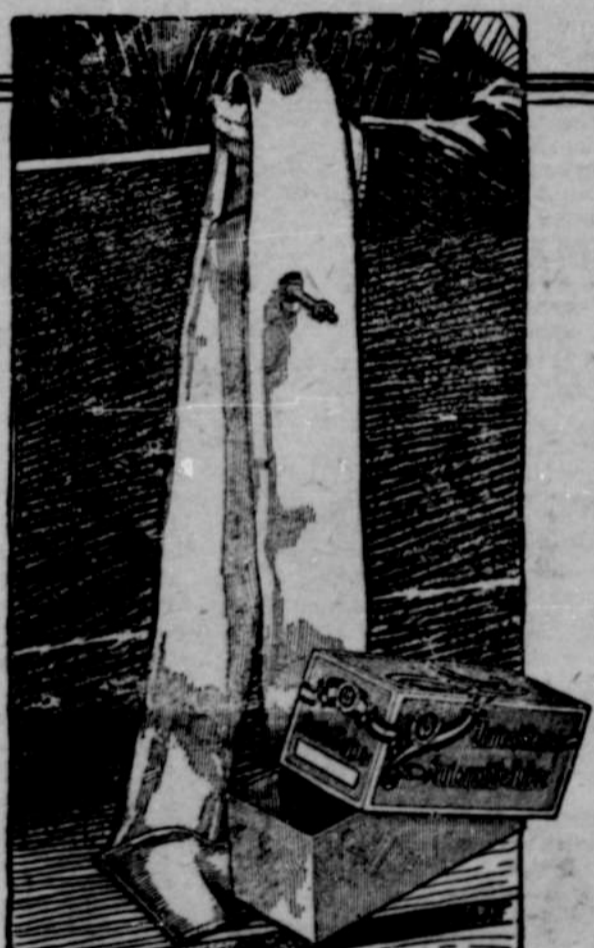
U. S. TUBES The same standard of quality built into U. S. Tires is put into U. S. Tubes.