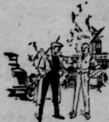
"Find the U. S. Tire dealer with the full, completely sized line of fresh, live U. S. Tires."

Find the U. S. Tire dealer who has the intention of serving you. You will know him by his full, completely sized line of fresh, live U. S. Tires—quality first, and the same choice of size, tread and type as in the biggest cities of the land.