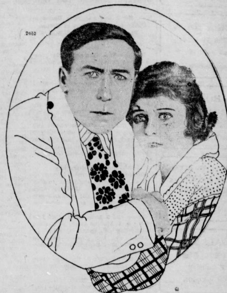
WILLIAM S. HART and MARY THURMAN in "SAND" A PARAMOUNT-ARTCRAFT PICTURE

CIVILIAN CLOTHES WITH THOMAS MEIGHAN" STAR OF "MIRACLE MAN." SUNDAY MATINEE AND EVENING. MATINEE 2:00 P.M. EVENING 7:00 P.M.- MARCH 13th