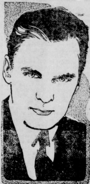
THOMAS MEIGHAN in "CIVILIAN CLOTHES" A PARAMOUNT PICTURE

"MARY MILES MINTER" IN ALL SOULS EVE. MONDAY, MARCH 14th