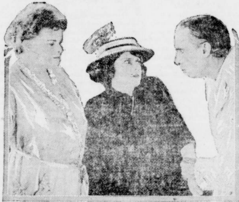
SCENE FROM 'CINDERELLA'S TWIN' STARRING VIOLA DANA

Is just the sort of girl that you'd like for a sister—or better still, for a sweetheart