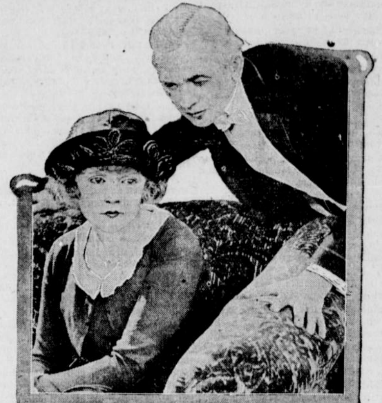
MAY ALLISON in "HELD IN TRUST"