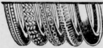
ROYAL CORD—NOBBY CHAIN—USCO—PLAIN

For best results—everywhere—U. S. Royal Cords.