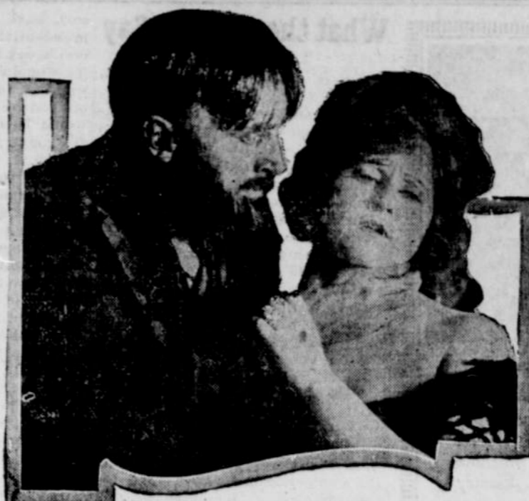
HOPE HAMPTON in "A MODERN SALOME"