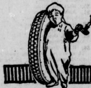
Time to Retire? (Buy Fisk)