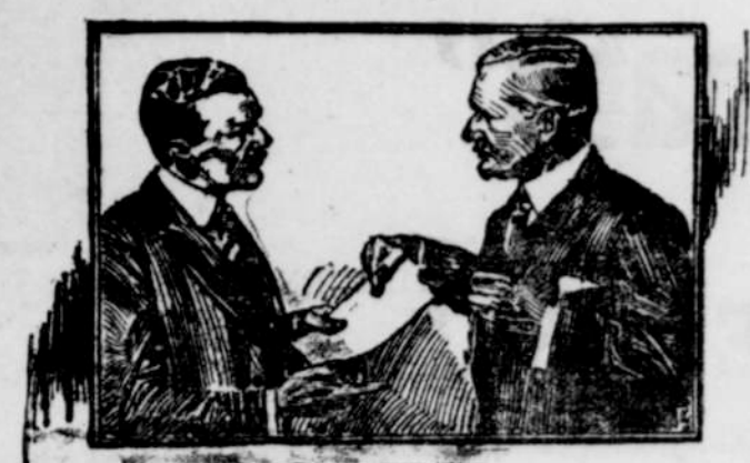
businesslike Answer to a businesslike Ouestion

THIRTY denominations cooperating in the Interchurch World Movement have budgeted their needs. No business could have done it more scientifi-