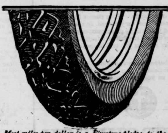
Most miles per dollar is a Firestone pledge, to the big car owner as well as to the owners of light cars. See the new Standard Oversize Firestone Cord.

It was a problem made to order for Firestone—big volume production of a high grade article. Firestone met it with a typical Firestone answer—a separate $7,000,000 factory. Buy Firestones.