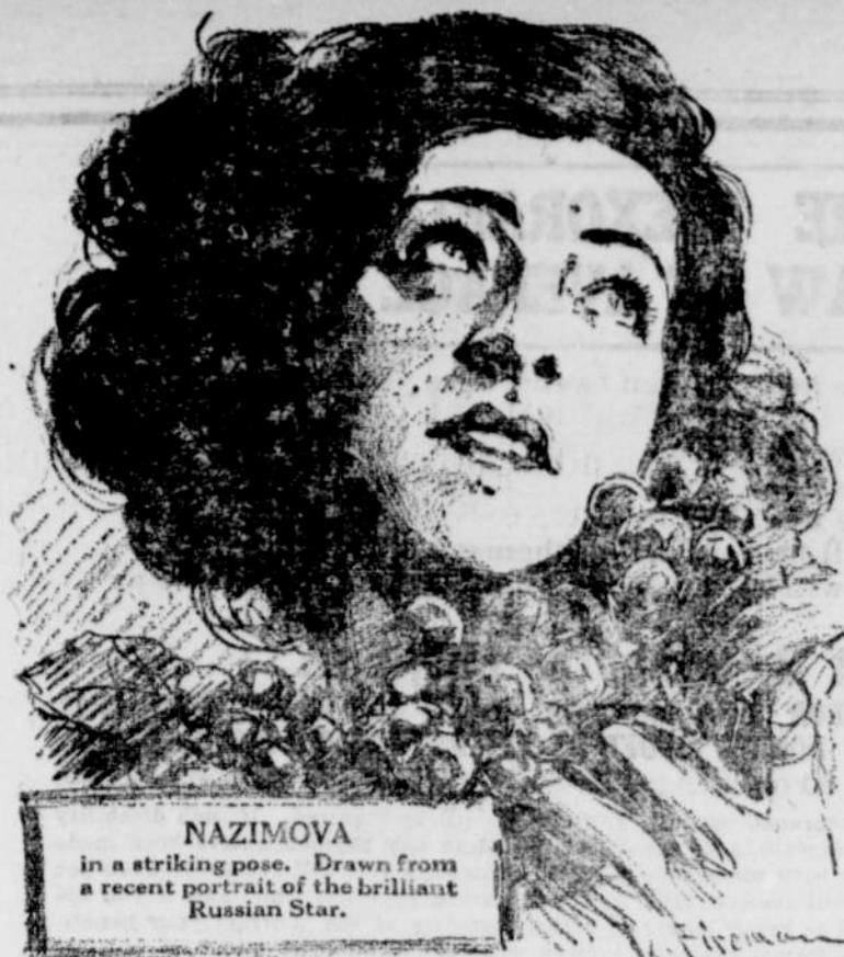
NAZIMOVA in a striking pose. Drawn from a recent portrait of the brilliant Russian Star.