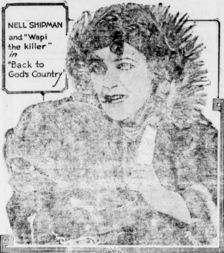
NELL SHIPMAN and "Wapi the killer" in "Back to God's Country"

A tale of love and villainy adapted from the story "Wapi, the Walrus," by James Oliver Curwood, published in "Good Housekeeping," featuring the brilliant and daring swimming star Bell Shipman. Winter scenes and Wapi's Great Fight for Dolores' life actually photographed away up in the Arctic Circle (North of 53 degrees.)