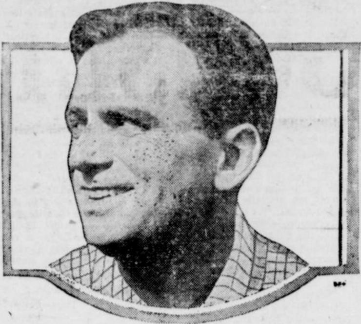
DOUGLAS FAIRBANKS in "The Knickerbocker Buckaroo" An ARTCRAFT Picture

You'll have to hurry and come early if you want seats.