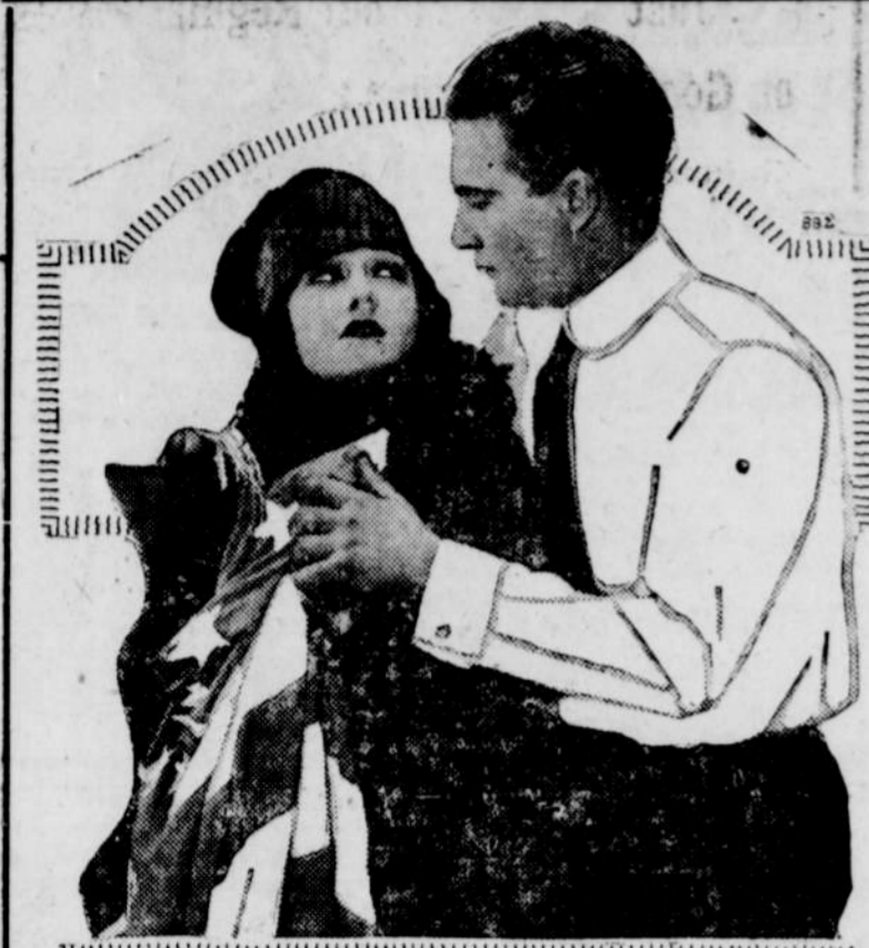
Gloria Swanson and Tom Forman in "For Better, For Worse" An ARTCRAFT Picture