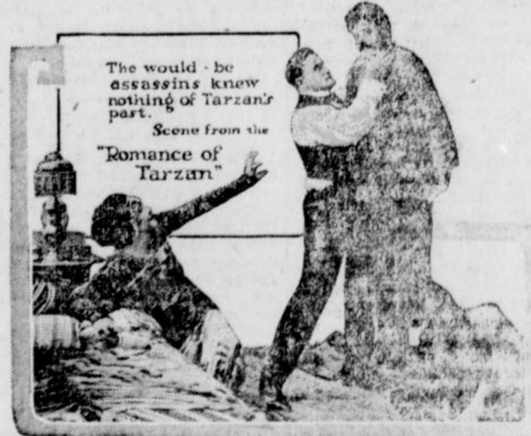
The would-be assassins knew nothing of Tarzan's part. Scene from the "Romance of Tarzan"