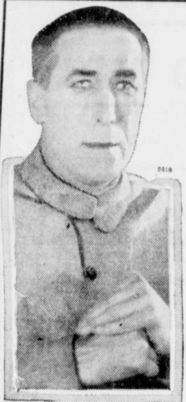
Thos. H. Ince presents Wm. S. HART "The Poppy Girl's Husband" An AUTOCRAFT Picture

"The Poppy Girl's Husband," Featuring WILLIAM S. HART. Tuesday, Decr. 23rd.