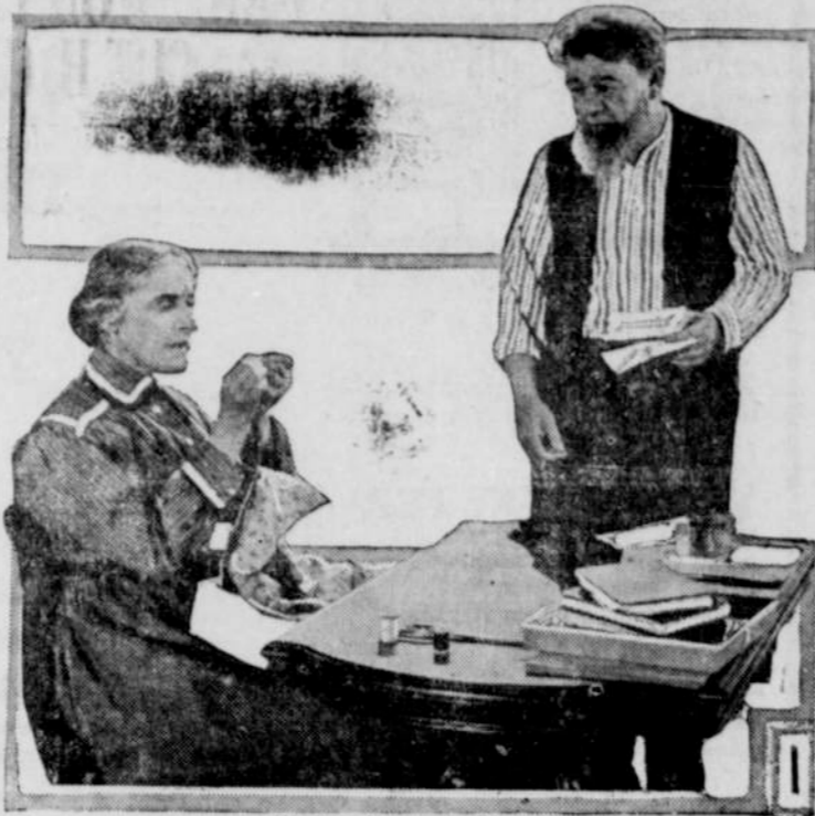
"Mother, he's coming back!" D.W. Griffith's "A ROMANCE OF HAPPY VALLEY"