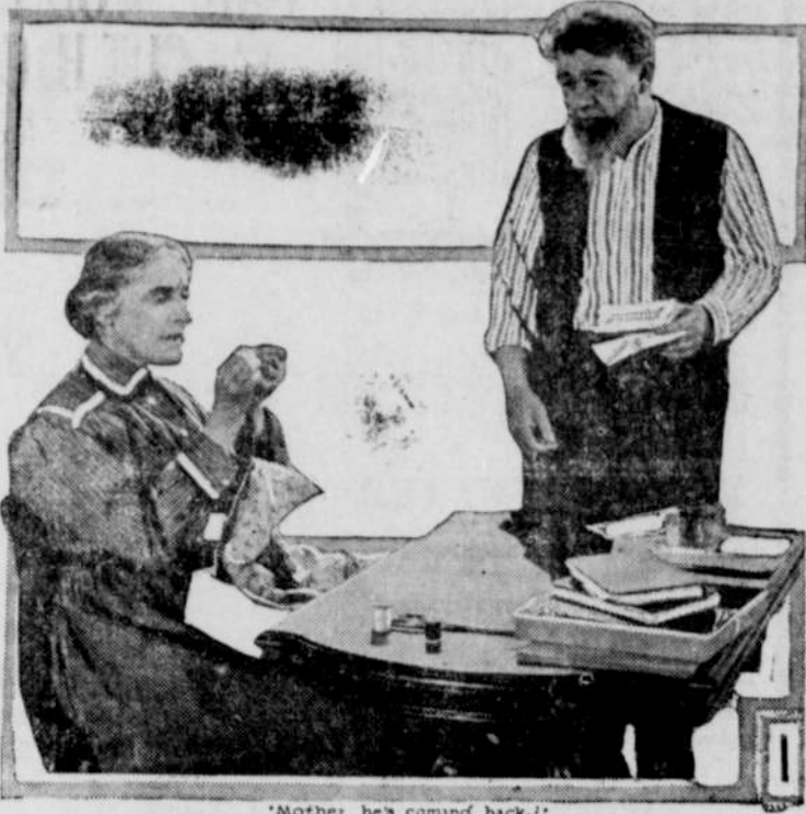
"Mother, he's coming back!" D.W. Griffith's "A ROMANCE OF HAPPY VALLEY" An ARCTIC Film