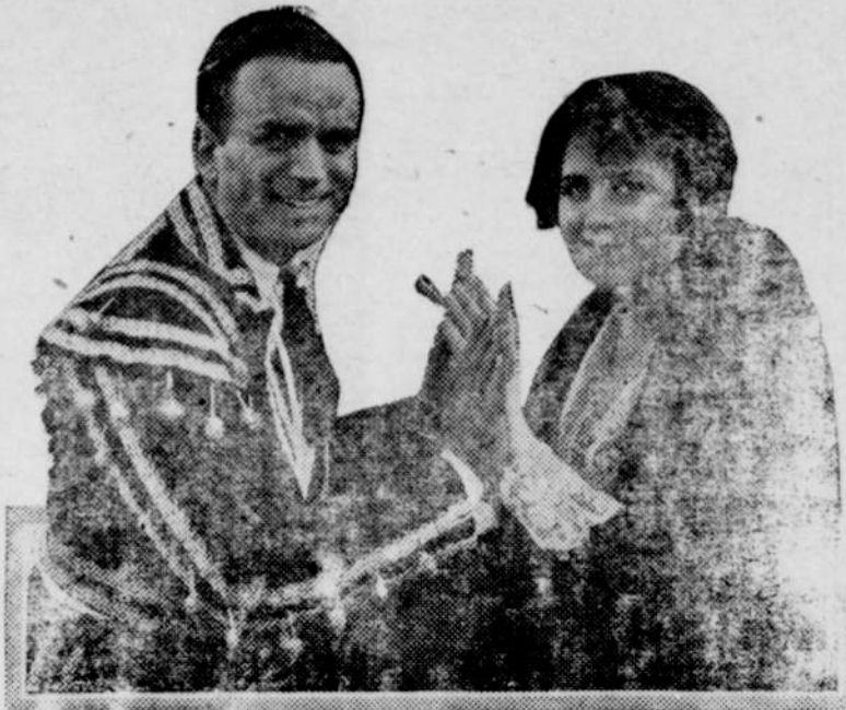
DOUGLAS FAIRBANKS in "Headin' South." An ARTCRAFT Picture