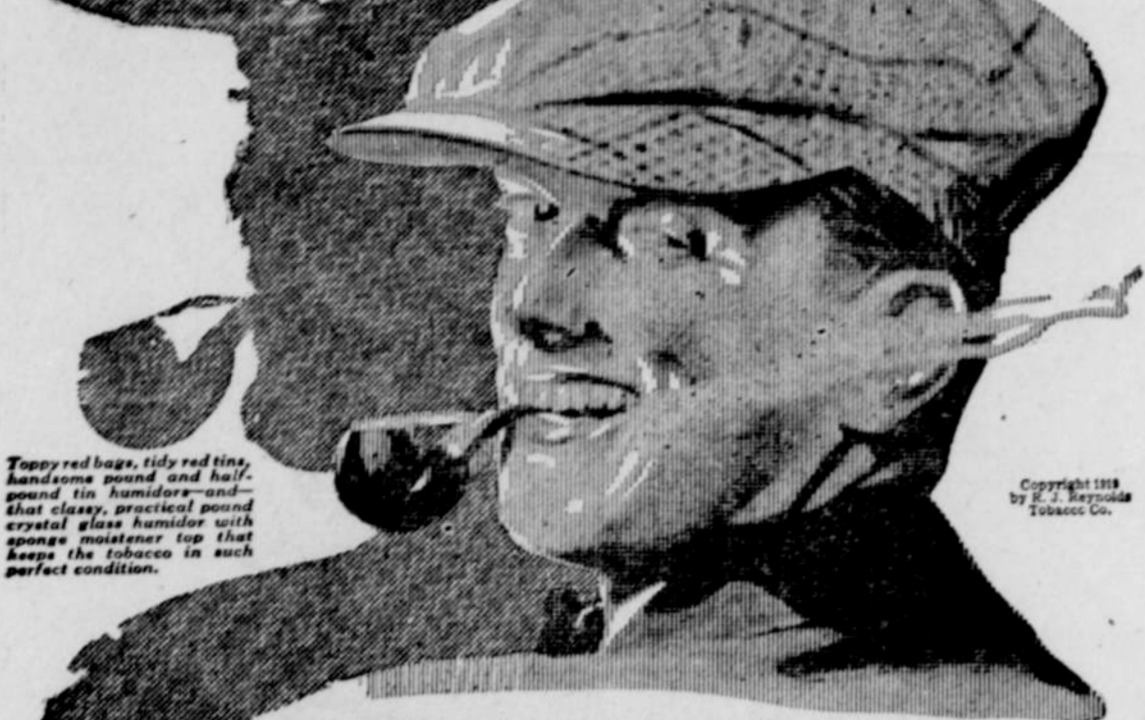
Tappy red bags, tidy red tins, handsome mouth and half-grown tin humidors—and that classy, practical round crystal glass humidor with sponge moisture top that keeps the tobacco in such perfect condition.