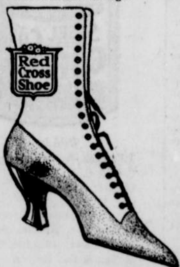
SEE SECOND AVENUE WINDOW.

Smart, stylish, comfortable, shape retaining Shoes in a One Day Sale of tremendous importance to women. At this price we expect many women will be here bright and early Saturday morning so be on time if you would share in the savings.