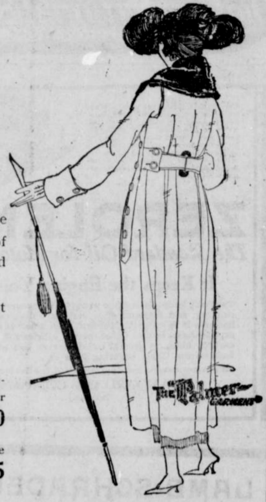
Ladies' Dress Skirts.