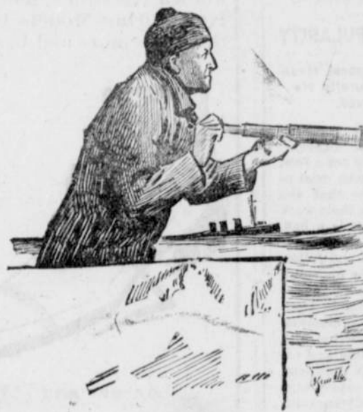
When you're on the lookout for submarines, a chew of Real Gravely helps to pass the long, dark hours.