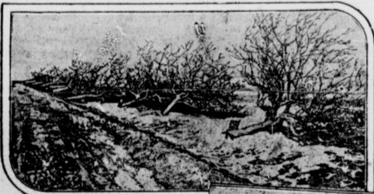
FRUIT TREES OF NORTHERN FRANCE DESTROYED BY RETREATING GERMANS