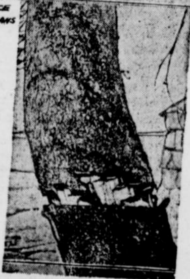
GIRDLED FRUIT TREE

WHEN the Germans retreated from long held positions in Northern France they girdled every fruit tree that time permitted. Here is such a tree, hacked beyond chance of the tree's surviving unless first aid measures were quickly adopted. In many cases the advancing French troops brought the first aid material and sometimes succeeded in saving the trees. Where the tree was absolutely cut down—as hundreds were—there was, of course, no relief measure to employ. Members of the U. S. Food Administration brought this picture to America. Early in the war the German government introduced a policy of strict food conservation at home and has endeavored to curtail in every possible manner the French and English supply. U boat warfare and destruction of farming property are parts of the same campaign.