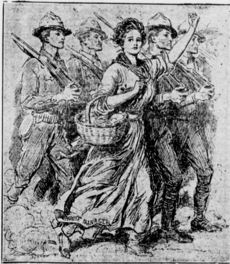
(Copyright by Life Pub. Co.) Courtesy of Life and Charles Dana Gibson.

The American House Manager is today a member of the army that is fighting to save democracy in the world. More than 11,000,000 managers of American homes have enlisted for the duration of the war and pledged themselves to support the fighting men by the way they buy, cook and serve food. Food will win the war, and these women will help to win it. America must send food to Europe. The armies cannot hold out if we fail to send it. Only certain foods