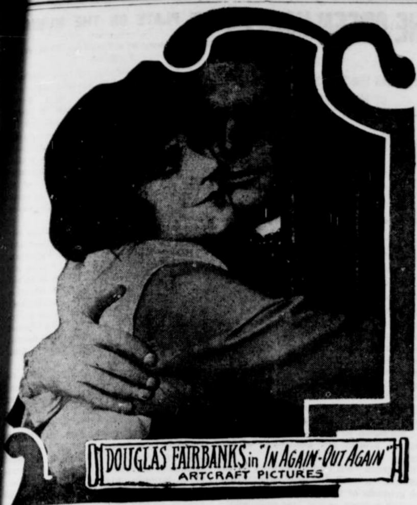
DOUGLAS FAIRBANKS in "IN AGAIN OUT AGAIN" ARTCRAFT PICTURES