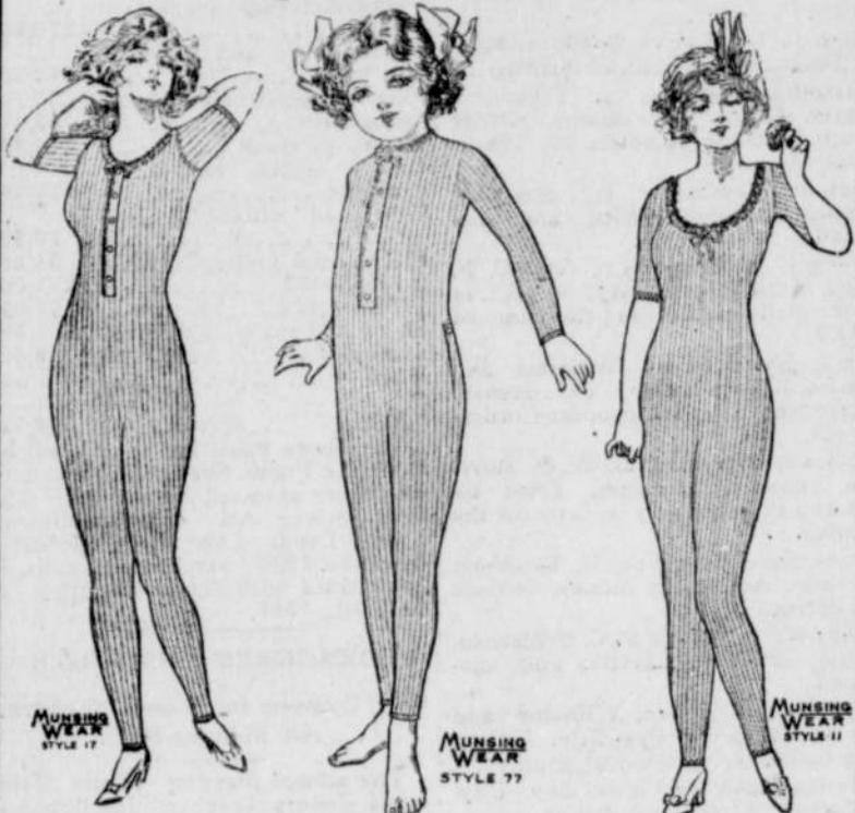
The Climax of the Munsingwear Story is in its Wearability.

WHEN you put on your first Munsingwear you will be delighted with the perfect fit and comfortable feeling afforded by the soft yarns and smooth finished seams. When it comes back from the wash you'll find it as comfortable, as shapely, as perfect-fitting as ever.