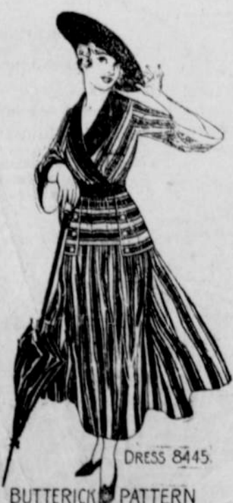
DRESS 8445 BUTTERICK'S PATTERNS

See the New Blouses today-- They are the ever desirable Welworth and cannot be bought in any other store.