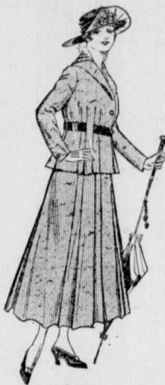
This Stylish Suit Model, $18.75

Choose your Summer Dress now and secure a pretty style fabric at a saving price. Per Yard - 69c.