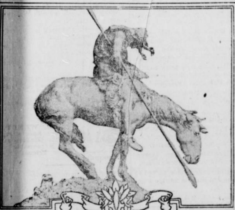
"THE END OF THE TRAIL," PANAMA-PACIFIC INTERNATIONAL EXPOSITION, SAN FRANCISCO, 1915.

The Argentine Republic early set aside a larger sum than any ever appropriated by a foreign nation for representation in an American exposition. The modern cities of Argentina, the schools, churches, libraries, the great live stock and agricultural interests will be extensively portrayed, and the mutual interests of South America and North America will be emphasized in almost every conceivable manner. From South Africa will be shown diamond exhibits and methods of extraction. The magnificent Canadian displays will review not only the widely known agricultural wealth, but will illustrate the scenic charms of the great Dominion, of snow clad mountain peaks, of far-reaching forest, of inland lakes in chains of silver and rushing mountain streams.