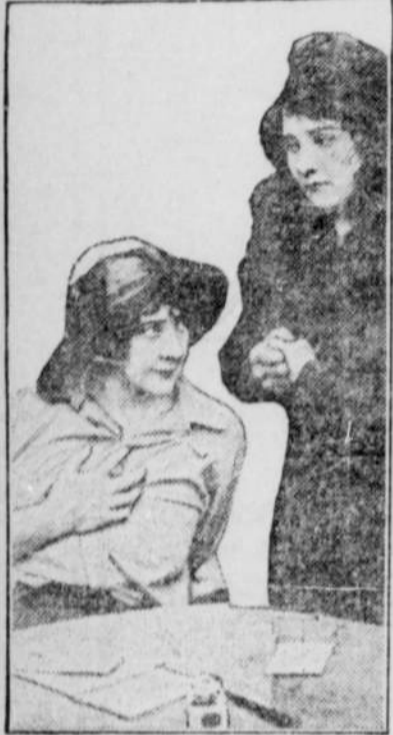
Rose Turned on Her Passionately.

A slight pause prefaced words that were a whispered prayer: "God send that he be not dead! Have I lingered