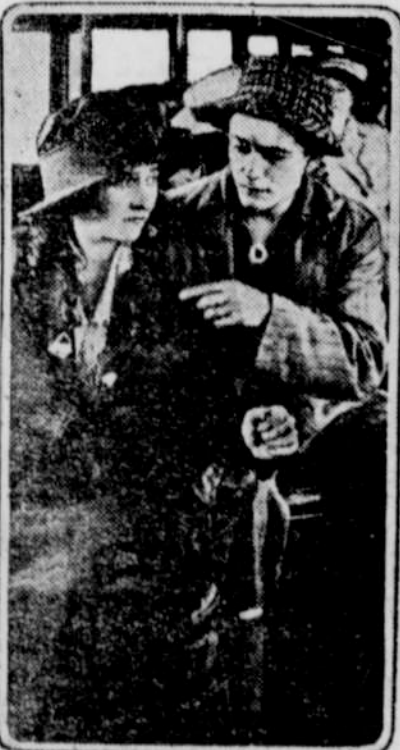
He Could Have Ground His Teeth in Exasperation.

He could have ground his teeth in exasperation—the impish insolence of that warning, timed so precisely to set their nerves on edge at the very mo-