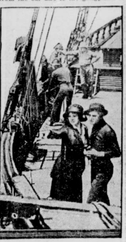
Lingered Watchfully on Deck.

Here, Alan had feared, was the crucial point of danger—if the influence of the trey of hearts was to bring disaster upon them it would be here, in the hush and darkness of this deserted water front. And he bore himself most warily as he helped the girl from the car and to the gangplank of