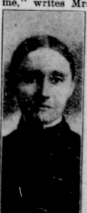
They have cured me and made my life worth living.