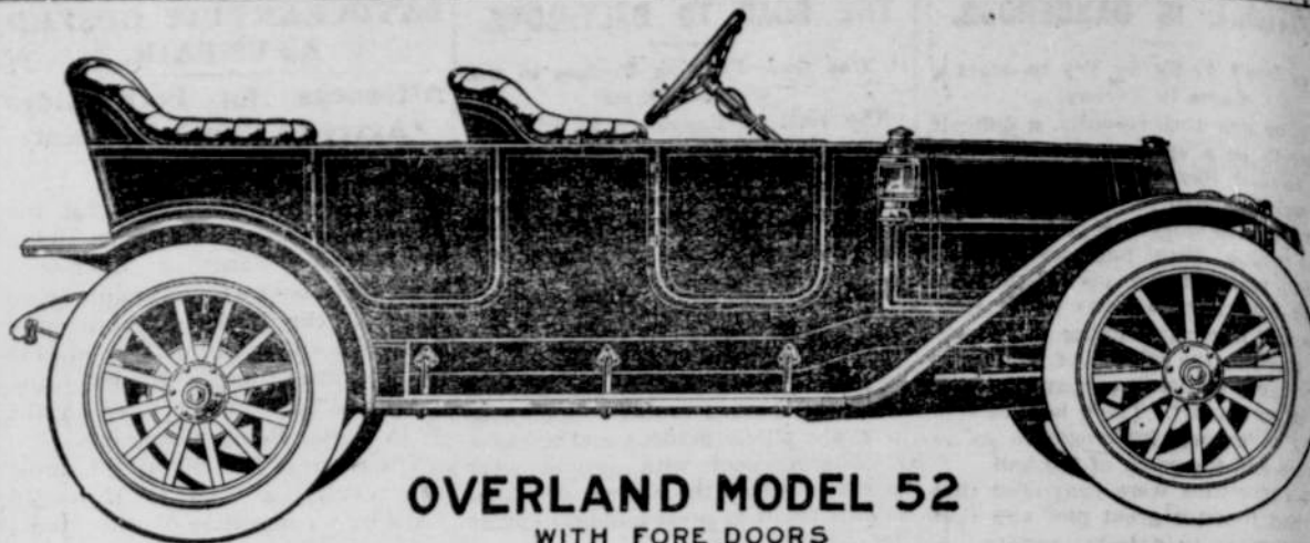
OVERLAND MODEL 52 WITH FORE DOORS

To the end that we may speedily carry into effect the above program, we invite the earnest co-operation and support of all who wish to reward industry, abolish graft, poverty and crime and promote the general welfare of all worthy citizens.