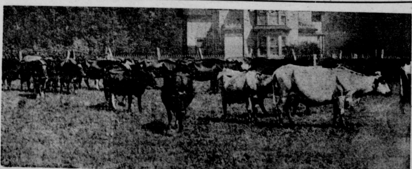
DAIRY SCENE IN TILLAMOOK COUNTY.

Tillamook County has Good Schools, with a number of Free and Up-to-Date High Schools.