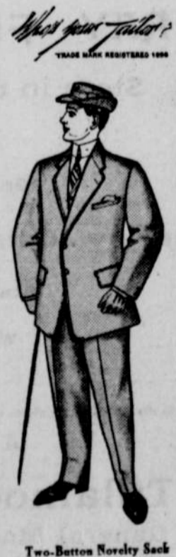
Two-Button Novelty Sack No. 517