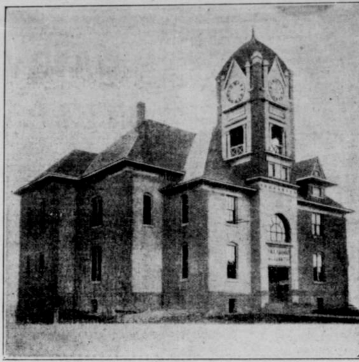
TILLAMOOK COUNTY'S NEW COURT HOUSE.

The one institution of which the people of Tillamook City are most proud, is the High School. This institution was established by vote of the district seven years ago. The first twelfth grade class graduated therefrom in June, 1904. Since then, sixteen young men and women have completed the course and received their diplomas. Many of these graduates are now engaged in teaching, and are filling various places in the schools of this and other counties, with credit to themselves and to the institution. Several graduates are now attending higher institutions of learning in this state. The High School curriculum has been placed on the accredited list of several higher institutions, including the University of Oregon, Oregon State Normal School, Washington State University and Stanford University. A class of five will graduate from the twelfth grade