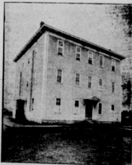
ST. ALPHONSUS ACADEMY.