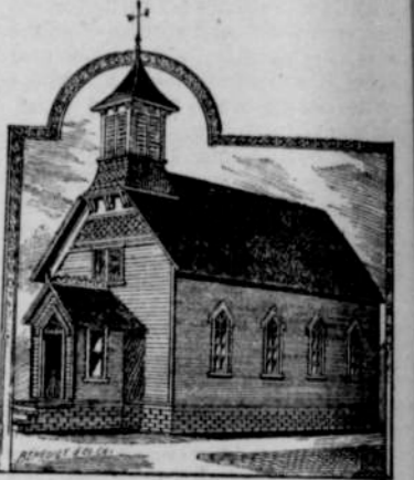
M.E. CHURCH, TILLAMOOK CITY.

In addition to the public school facilities afforded to the people of Tillamook, there is a splendid parochial school now under management of the Sisters of St. Mary. The academy occupies a large three story building in the eastern part of Tillamook City. The school is conducted on both the day plan and boarding plan. Students are in attendance from all over the county. The course of study in addition to the regular academic work, includes sewing, painting and instrumental music on both the piano and violin. Five Sisters are employed and the school remaining in session ten months each year. Nearly one hundred students were enrolled last year.