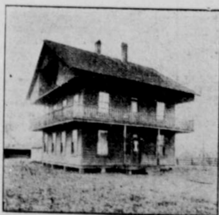
THE PARISH HOUSE.

This building was erected in 1905 and is in every respect a modern, up-to-date school building, with eight commodious and well lighted, well ventilated and well heated rooms, with all the paraphernalia necessary in a well equipped school, including an expensive piano. It is heated with steam and the school directors make it a special point to employ a splendid corps of teachers. The citizens of Tillamook City are justly proud of their public and high school, and with a magnanimous spirit allow pupils from other districts to take the high school course at a nominal charge. After pupils have graduated from this high school, should they desire more education, can enter the State University at Eugene.