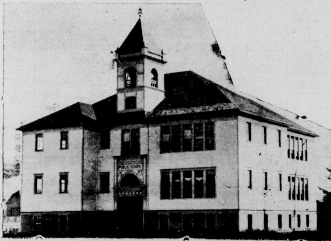
TILLAMOOK CITY PUBLIC AND HIGH SCHOOL.

Tillamook County affords splendid enjoyment during the whole season for camping parties. Hundreds of wagons, loaded with campers and camping outfits, visit Tillamook every year. They spend part of the time camping in the mountains hunting and fishing and then go to the beach and rusticate, bathing, clam digging and berry picking.