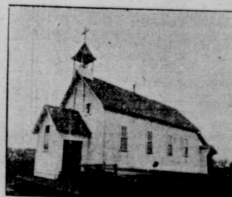
SACRED HEART CATHOLIC CHURCH.