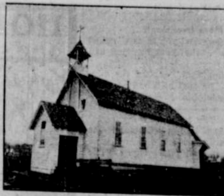
SACRED HEART CATHOLIC CHURCH.

this coming June, many of whom will enter higher schools next year.