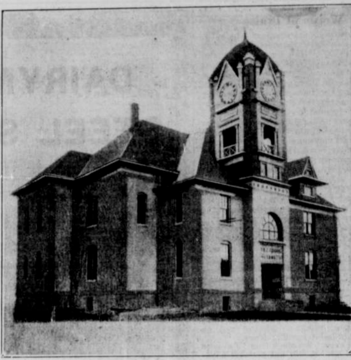
TILLAMOOK COUNTY'S NEW COURT HOUSE.

The one institution of which the people of Tillamook City are most proud, is the High School. This institution was established by vote of the district seven years ago. The first twelfth grade class graduated therefrom in June, 1904. Since then, sixteen young men and women have completed the course and received their diplomas. Many of these graduates are now engaged in teaching, and are filling various places in the schools of this and other counties, with credit to themselves and to the institution. Several graduates are now attending higher institutions of learning in this state. The High School curriculum has been placed on the accredited list of several higher institutions, including the University of Oregon, Oregon State Normal School, Washington State University and Stanford University. A class of five will graduate from the twelfth grade