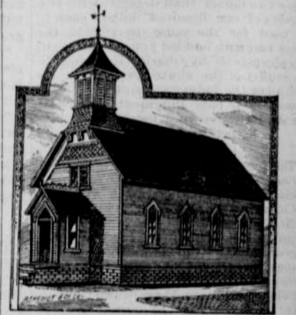
M.E. CHURCH, TILLAMOOK CITY.

In addition to the public school facilities afforded to the people of Tillamook, there is a splendid parochial school now under management of the Sisters of St. Mary. The academy occupies a large three-story building in the eastern part of Tillamook City. The school is conducted on both the day plan and boarding plan. Students are in attendance from all over the county. The course of study in addition to the regular academic work, includes sewing, painting and instrumental music on both the piano and violin. Five Sisters are employed and the school remaining in session ten months each year. Nearly one hundred students were enrolled last year.