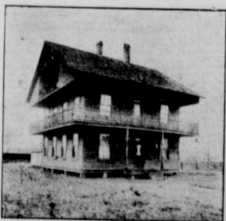
THE PARISH HOUSE.

This building was erected in 1905 and is in every respect a modern, up-to-date school building, with eight commodious and well lighted, well ventilated and well heated rooms, with all the paraphernalia necessary in a well equipped school, including an expensive piano. It is heated with steam and the school directors make it a special point to employ a splendid corps of teachers. The citizens of Tillamook City are justly proud of their public and high school, and with a magnanimous spirit allow pupils from other districts to take the high school course at a nominal charge. After pupils have graduated from this high school, should they desire more education, can enter the State University at Eugene.