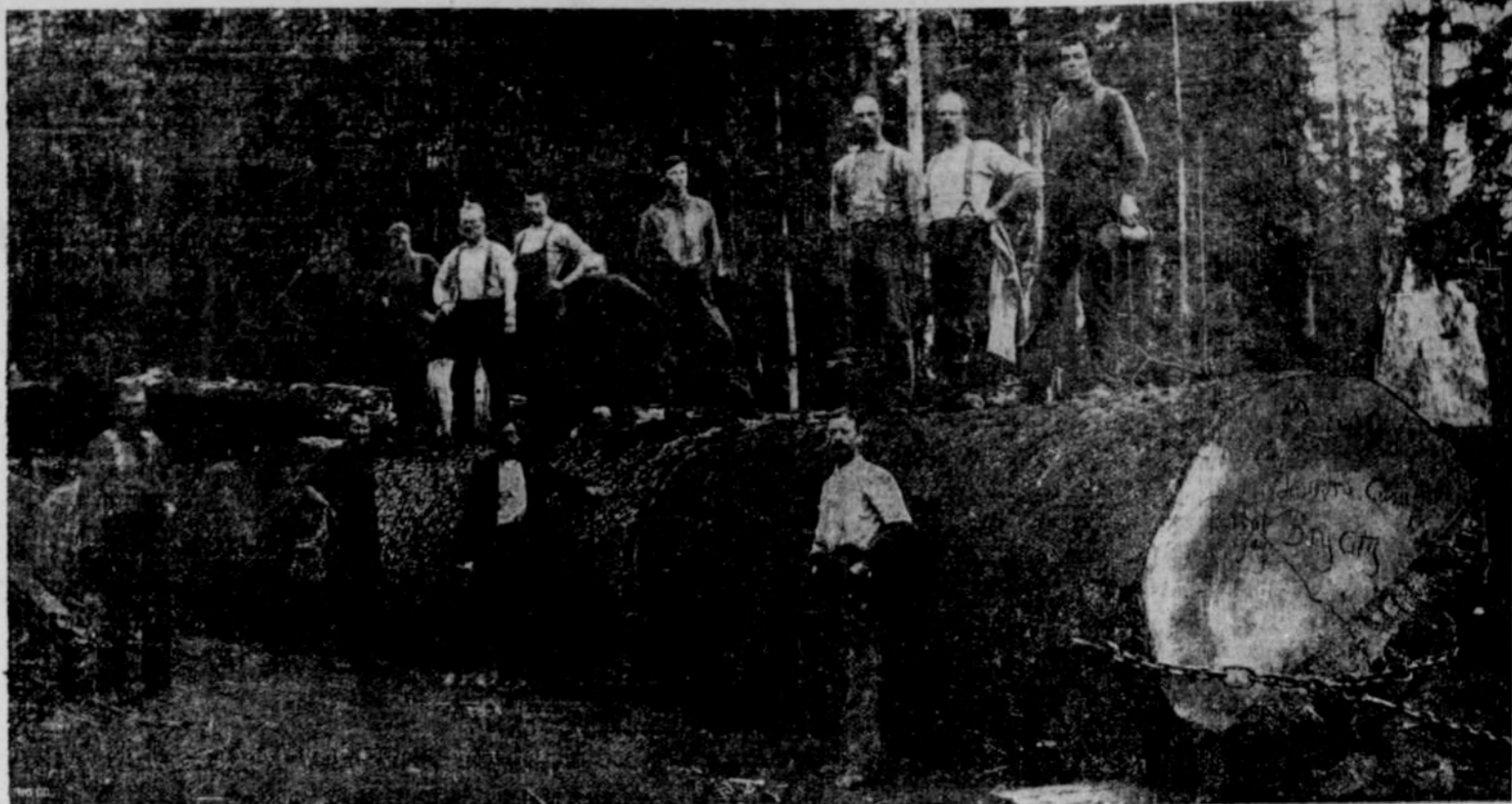
LOGGING SCENE AND A SPECIMEN OF TILLAMOOK TIMBER.

From the above explanation of climatic conditions of Tillamook, it may be readily inferred that healthfulness is one of the chief attributes of this favored region. On account of the evenness of temperature, abundant moisture, con-