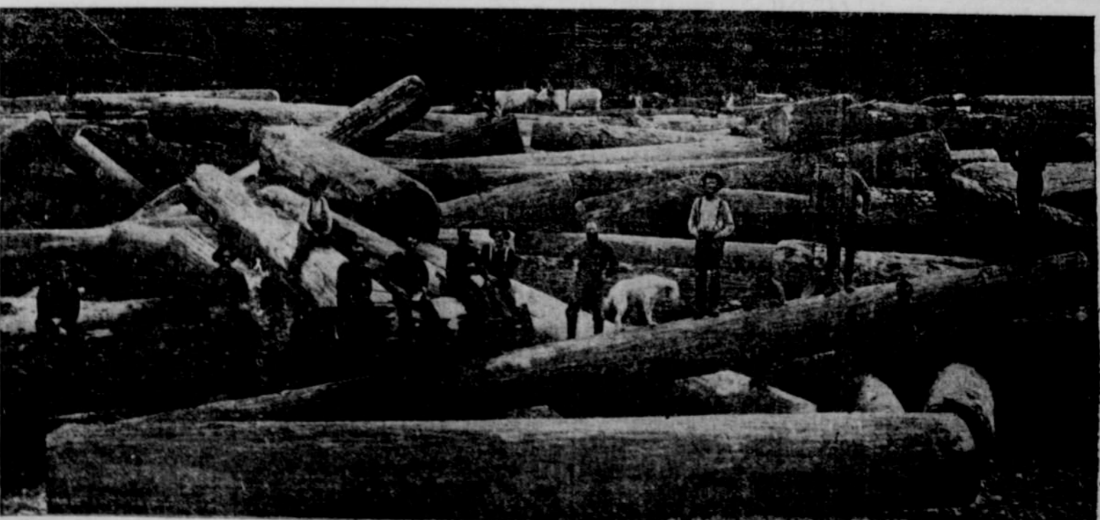
A LOG-JAM ON TRASK RIVER.

In the northern part of the county is the Nehalem River, which widens out about two miles from its mouth into a bay of about one and a half by two miles, upon which are fine mill sites and booming grounds. There is about 20,000,000,000 feet B. M. of timber tributary to this bay. Netarts Bay is surrounded by quite a heavily timbered area, but has no streams of any size emptying into it. Nestucca Bay in the south end of the county, is accessible to small ocean boats. There is but little timber tributary to this bay, though enough for local needs. Tillamook Bay, which is one of the best harbors on the Oregon coast, empties into the Pacific Ocean, about 30