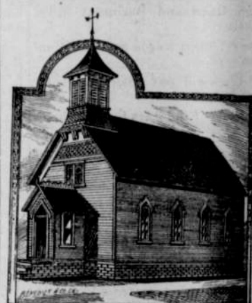
M.E. CHURCH, TILLAMOOK CITY.

In addition to the public school facilities afforded to the people of Tillamook, there is a splendid parochial school now under management of the Sisters of St. Mary. The academy occupies a large three story building in the eastern part of Tillamook City. The school is conducted on both the day plan and boarding plan. Students are in attendance from all over the county. The course of study in addition to the regular academic work, includes sewing, painting and instrumental music on both the piano and violin. Five Sisters are employed and the school remaining in session ten months each year. Nearly one hundred students were enrolled last year.