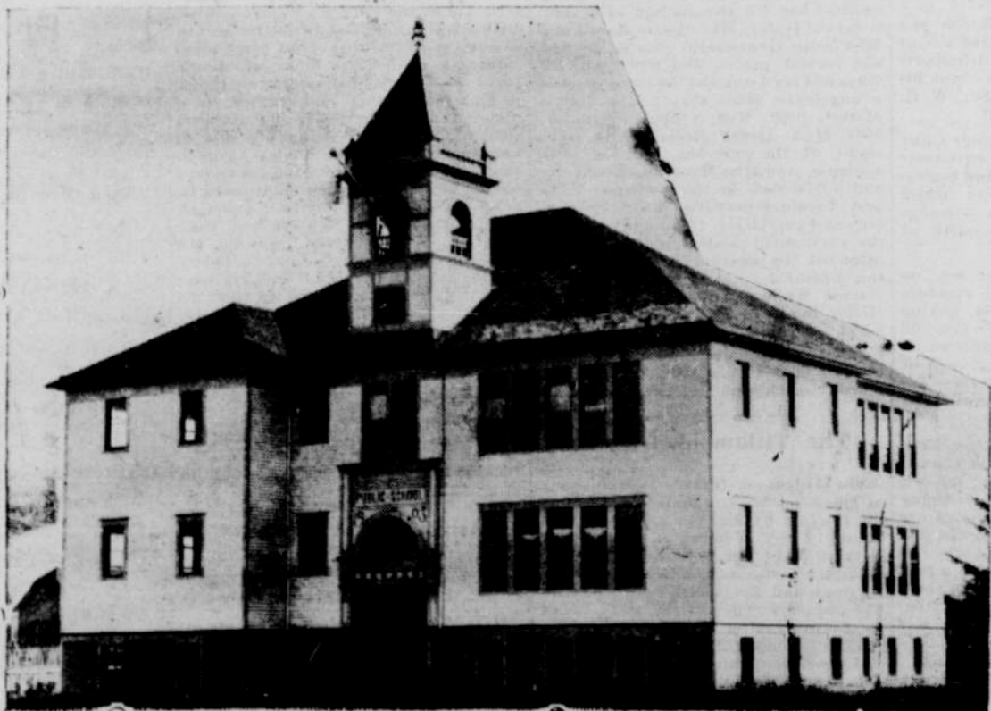
TILLAMOOK CITY PUBLIC AND HIGH SCHOOL.

Tillamook County affords splendid enjoyment during the whole season for camping parties. Hundreds of wagons loaded with campers and camping outfits, visit Tillamook every year. They spend part of the time camping in the mountains hunting and fishing and then go to the beach and rustic, bathing, clam digging and berry picking.