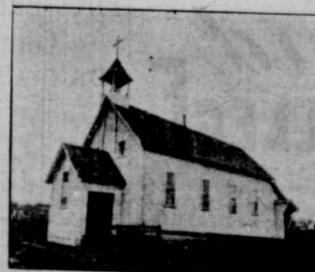
SACRED HEART CATHOLIC CHURCH.