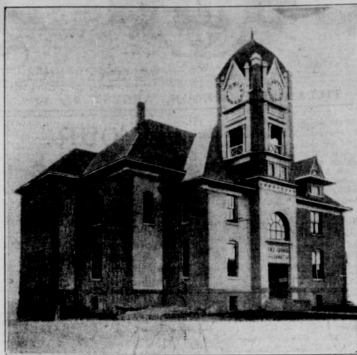
TILLAMOOK COUNTY'S NEW COURT HOUSE.

The one institution of which the people of Tillamook City are most proud, is the High School. This institution was established by vote of the district seven years ago. The first twelfth grade class graduated therefrom in June, 1904. Since then, sixteen young men and women have completed the course and received their diplomas. Many of these graduates are now engaged in teaching, and are filling various places in the schools of this and other counties, with credit to themselves and to the institution. Several graduates are now attending higher institutions of learning in this state. The High School curriculum has been placed on the accredited list of several higher institutions, including the University of Oregon, Oregon State Normal School, Washington State University and Stanford University. A class of five will graduate from the twelfth grade