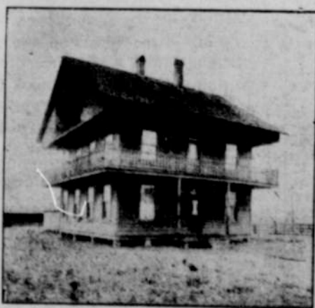
THE PARISH HOUSE.

This building was erected in 1905 and is in every respect a modern, up-to-date school building, with eight commodious and well lighted, well ventilated and well heated rooms, with all the paraphernalia necessary in a well equipped school, including an expensive piano. It is heated with steam and the school directors make it a special point to employ a splendid corps of teachers. The citizens of Tillamook City are justly proud of their public and high school, and with a magnanimous spirit allow pupils from other districts to take the high school course at a nominal charge. After pupils have graduated from this high school, should they desire more education, can enter the State University at Eugene.