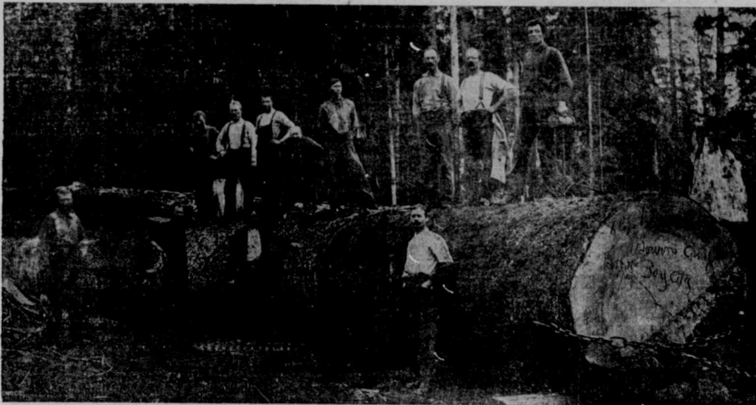
LOGGING SCENE AND A SPECIMEN OF TILLAMOOK TIMBER.

From the above explanation of climatic conditions of Tillamook, it may be readily inferred that healthfulness is one of the chief attributes of this favored region. On account of the freshness of temperature, abundant moisture, con-