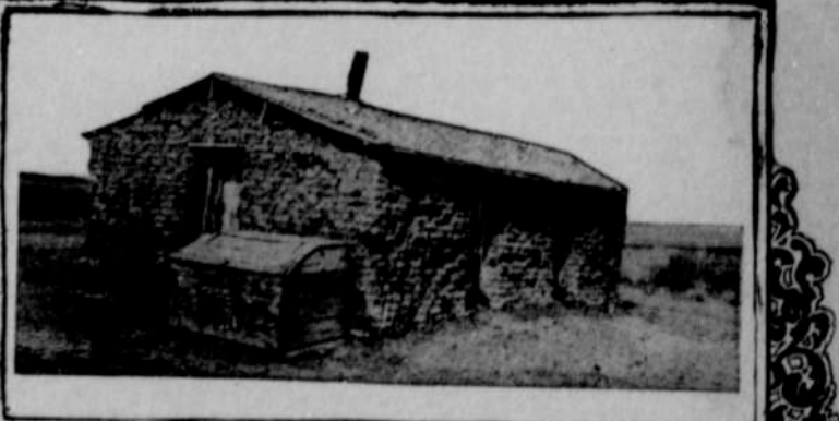
THE LAST SOD SCHOOL HOUSE IN NORTON COUNTY, KANSAS.

Resolutions were recently adopted at the closing sessions of the American Institute of Instruction at New Haven favoring the installing of industrial departments in every efficient school system. The institute also placed itself on record as holding that in view of recent developments of dishonesty in high places and of the increase of crime in different directions, it is the duty of the teachers to persistently train the American youth in honesty, integrity, and uprightness.