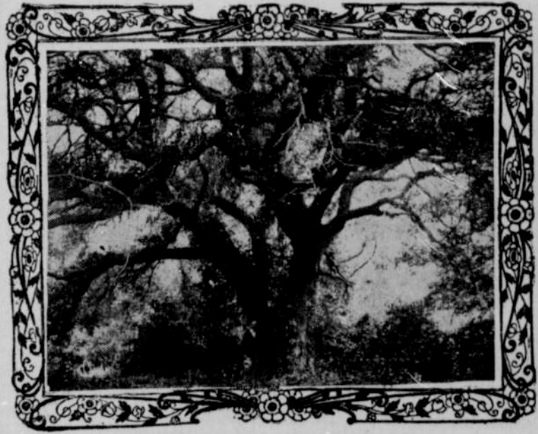
THE 1000 YEAR OLD POWHATAN OAK.

The county superintendent of schools has expressed the hope that the school may also do much work that will be of immediate practical benefit to the agriculture of the country, such as testing seeds for viability, or germinating power, and milk and cream for butter fat; treating oats and wheat