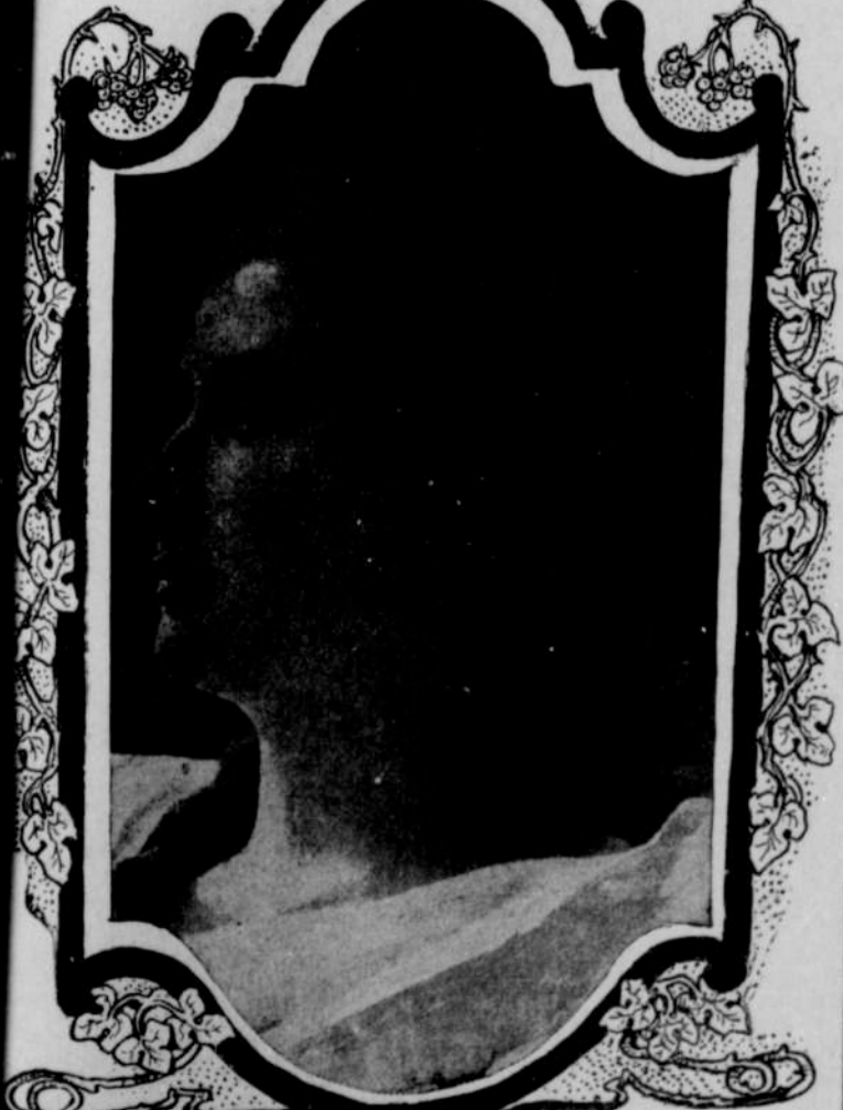
MADAME EMMA EAMES. A Popular Favorite of Grand Opera.

The homer pigeon, when traveling, seldom feeds, and if the distance to its home be long it arrives thin, exhausted, and almost dying. If corn be presented to it, it refuses to eat, contenting itself with drinking a little water, and then sleeping. Two or three hours later it begins to eat with great moderation, and sleeps again immediately afterwards. If its flight has been very prolonged the pigeon will proceed in this manner for forty-eight hours before recovering its normal mode of feeding.