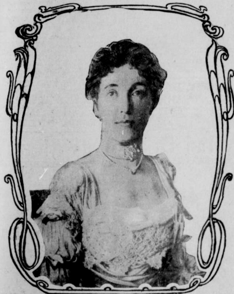
MADAME JUSSERAND—WIFE OF THE FRENCH AMBASSADOR.

Once behind prison bars he gave up all his leisure time to study. At the beginning of his term he could read and write English and German. During the first years of his imprisonment he eagerly perused all books in those languages that he could secure. In course of time he mastered the Slavic, Polish and Hungarian languages, and also acquired a good general knowledge of Italian, Spanish and French.