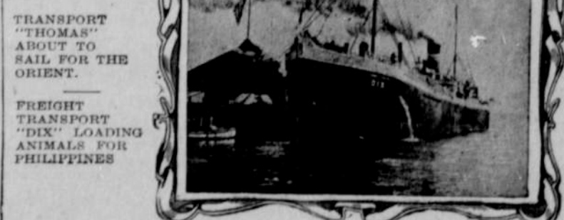
TRANSPORT "DIX" LOADING ANIMALS FOR PHILIPPINES.

not such as are provided for steerage passengers on the Pacific, and if vessels so equipped were owned and operated by a private line, that line would be long in getting rid of them should the army be suddenly recalled from the Islands. Furthermore, the army transport must carry a battery of rapid fire guns in her bows, something for which private steamship companies have very little use.