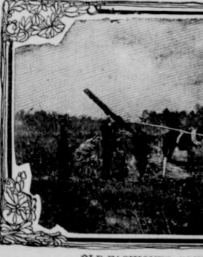
OLD-FASHIONED SOUTHERN SUGAR MILL.

CO-OPERATIVE DISTILLERIES. That the farmers in all corn-growing sections of the country should establish co-operative distilleries for the sole purpose of producing this denatured industrial alcohol, is the