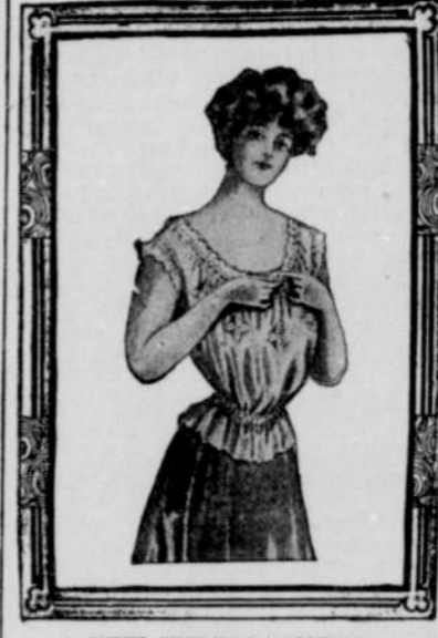
A NEW UNDERGARMENT.

In the new Paris lingerie, the fashion is to have sets of chemises, drawers and short petticoat of the same material and type, and all trimmed in the same manner. Nainsook and very fine batiste are the materials usually employed for their construction, the mode of silk underwear being for the time abandoned. There are two new fabrics called silk nainsook and silk chiffon, both cotton, but of very fine weave, and which do not lose their glossy appearance in washing. These materials have much the appearance of silk and in garments made of them lace is profusely used. The lace composes much of the upper portion of the chemise and the sleeves which are of bell shape reaching almost to the elbow. These are open