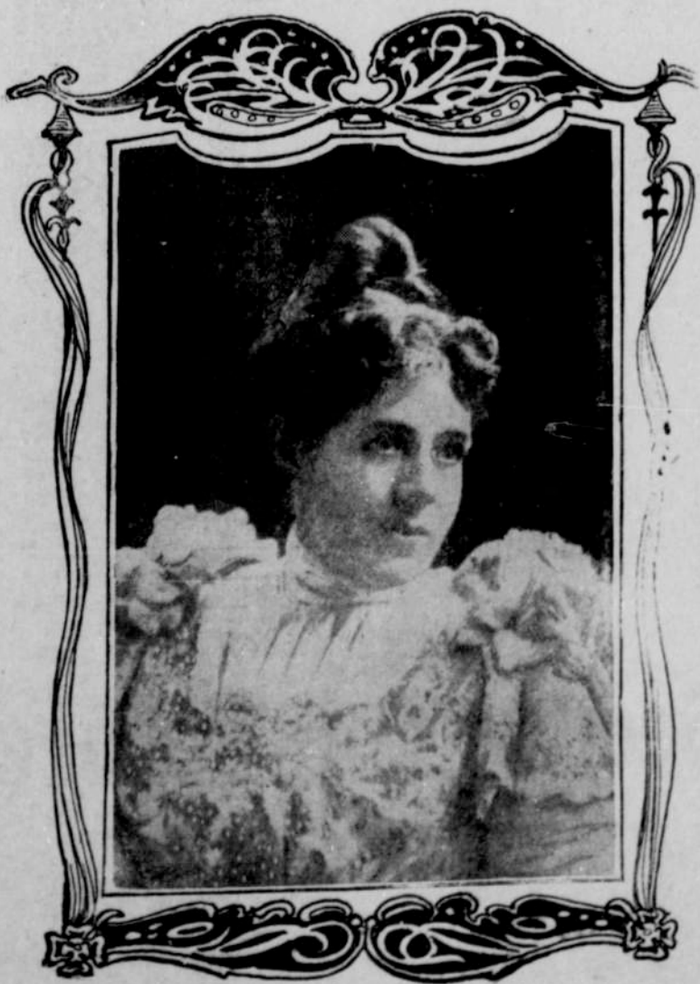
MRS. NELLIE GRANT SARTORIS.

His cowl was thrown back upon his shoulders, and his gown, unfastened