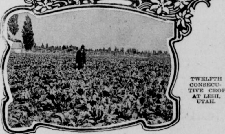
TWELFTH CONSECUTIVE CROP AT LEHI, UTAH.

year. The factories last year had a total capacity for slicing 40,050 tons of beets daily.