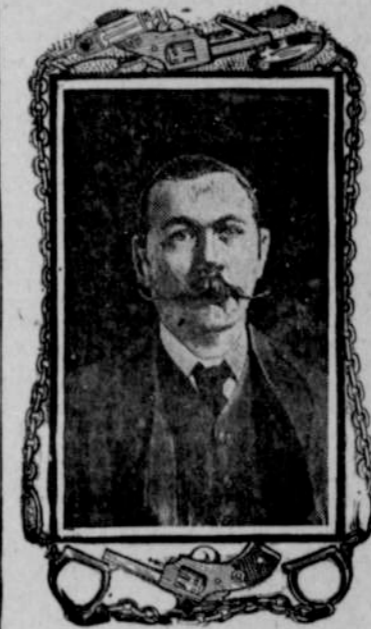
SIR A. CONAN DOYLE.

The author of "The White Company," "Sir Nigel," "Study in Scarlet" and other Sherlock Holmes stories—Sir Arthur Conan Doyle—was born in Edinburgh, Scotland, on Mar. 22, 1859. He comes of an artistic family, and is the grandson of John Doyle, the famous political caricaturist, whose pictorial sketches appeared for more than thirty years under the initials of "H. B.," without disclosure of the artist's