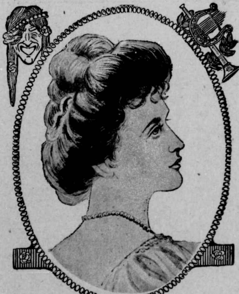
MRS. WALDORF ASTOR. One of the Five Original Gibson Girls.