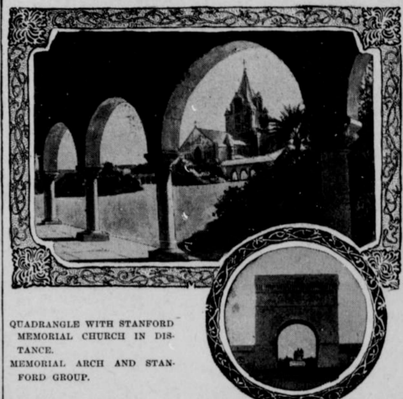
QUADRANGLE WITH STANFORD MEMORIAL CHURCH IN DISTANCE. MEMORIAL ARCH AND STANFORD GROUP.

Stanford University had its conception in 1884. There a fourteen year old American boy tossed in his bed, struck down by a malignant fever. His fond mother knelt at his bedside and as his young life passed out, she arose filled with an inspiration