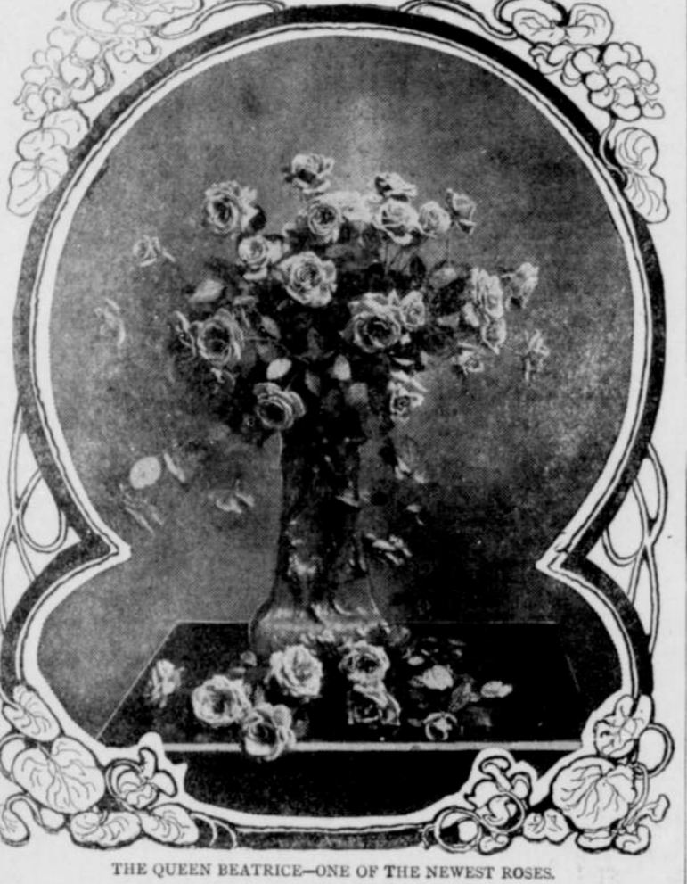
THE QUEEN BEATRICE—ONE OF THE NEWEST ROSES.

Roses must have good air and plenty of it, without being too much exposed; hence an elevated situation is better than one that is lower or stagnant. They should not, however, be exposed to too violent winds, for the foliage cannot stand whipping. Sometimes the protection of a clump of trees is sought, but unless the plants are set well away from them they will be robbed of plant food by the roots of the tree. To take advantage of this kind of protection the roses should be set twenty-five feet further away from the trees than the latter's height. The protection of buildings should be avoided, for so completely do these stop the circulation of air that mildew and blights follow from sheltered locations of this character. There are, however, exceptions to this rule, for sometimes in an elevated position there will be suitable circulation of air even close to a building. This depends largely upon the prevailing winds and the exposure of the locality.