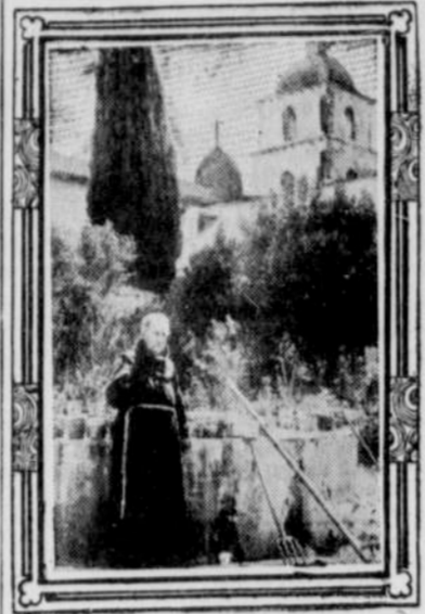
THE OLD WELL IN THE COURTYARD.

On the morning of December 8, 1812, all without warning, came a great catastrophe. While the church was crowded with kneeling worshippers a shock of earthquake visited the valley and toppled the great stone tower over upon the roof, crashing through which it buried the congregation beneath the wreckage of beams, tiles and stones, and upward of forty human beings lost their lives in the twinkling of an eye. This earthquake ranks in severity with that of Charleston, in 1886. So great was the disaster that, although the mission continued to be conducted