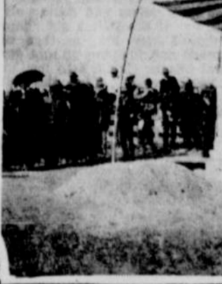
CHIEF JOSEPH AND MONUMENT UNVEILED BY WARRIORS OF HIS TRIBE.

As the chief and historian of his tribe, Joseph's plea for the Nez Perces has often been heard in Washington. In his deep sense of eternal righteousness and of the deadly wrong suffered at the hands of the white man; in its smothered fire and in its hopeful longing for the coming of justice and better times for the tribe, it was the most powerful and pathetic appeal ever made by an Indian.