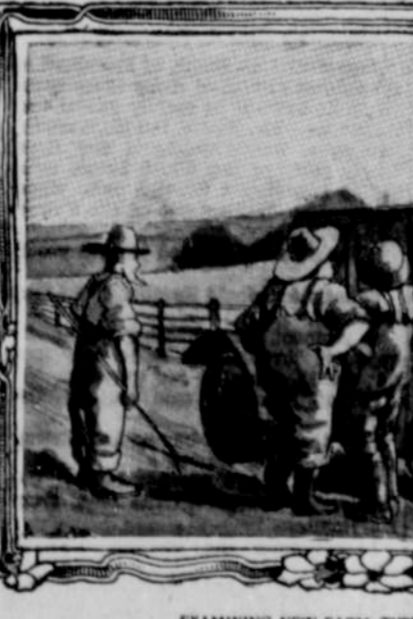
EXAMINING NEW FARM TYPE OF AUTOMOBILE.

"The machine carries two steel rails, which can be quickly unshipped and placed across a ditch." This feature is of great import to the average tiller of soil, as it means that if the machine becomes frightened or unmanageable due to the sudden appearance of horsemen or the flight of birds, and jumps ditches or fences, it can be quickly gotten back into the road, and sped along