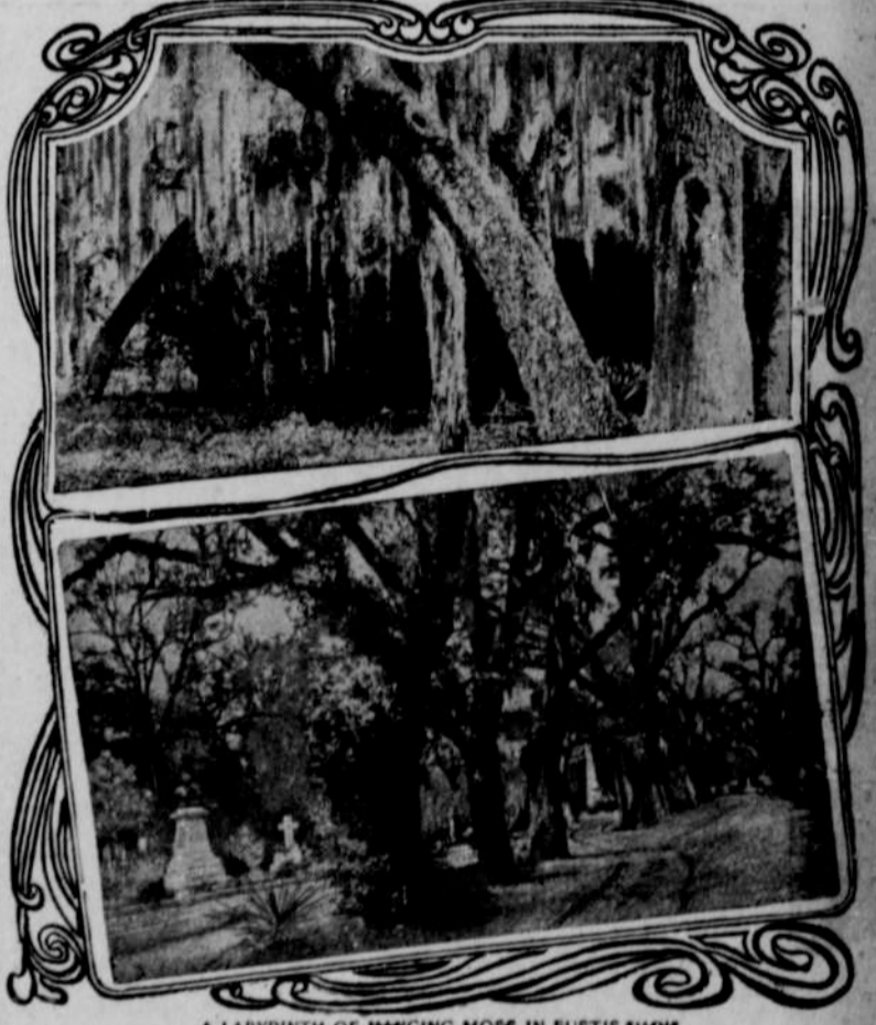
A LABYRINTH OF HANGING MOSS IN EUSTIS PARK, BONAVENTURE CEMETERY, SAVANNAH, GEORGIA.

The great majority of Italian immigrants come from the southern provinces, mainly Sicily and Calabria. They are farm bred.