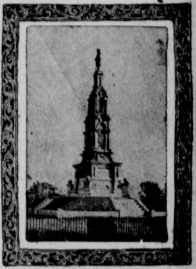
CONFEDERATE MONUMENT AT SAVANNAH

was attired in a white and gray cotton mother Hubbard gown tied around the waist with a white apron; around her neck she wore a black fur collar and on her head a very broad brimmed black hat turned up on one side in a jaunty manner. This colored lady, weighing 285 pounds, as I was told, proceeded to set the communion table. From his chair in the pulpit, the minister called out, "Let us know, sister,