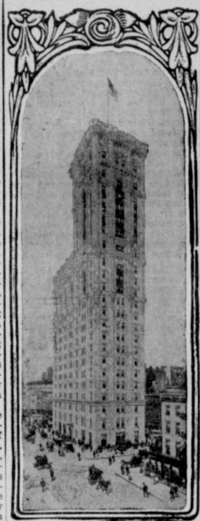
TIMES BUILDING. The Highest Structure in New York. cupola and—if that isn't high enough—a flagstaff. The highest building in New York today is the Times Building, including the three stories which are below New York's pavement.

by from 200 to 300 feet, and will be about 40 feet higher than the Washington monument. It is to be built at the north-west corner of Broadway and Liberty street, with a tower of 29 stories, which will rise to the height of 594 feet. The tower will be 65 feet square for 36 stories, and will be surmounted by a dome containing four additional stories, above which will be a