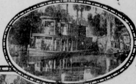
A Picturesque Landing Point of the Oklawaha Trip.

The Steamer Osceola Loading Some Oranges on the Oklawaha.